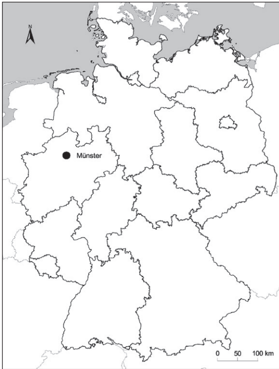
Fig. 1. Location of the study area in northwestern Germany.

is seldomly observed because of its inconspicuousness in the treetops (Thomas 1974). In addition, females regularly feed on plant nectar (Bourn & Warren 1998). The fecundity of females is linearly correlated with the longevity of the individual. The highest realised fecundity observed by Thomas (1974) was by a female that lived 39 days and laid 147 eggs.